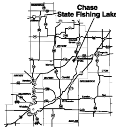
General Area Map

Consult information signs posted on the area for all regulations that apply to Chase State Fishing Lake and facilities.